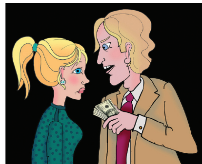
EconoMan Explains Money

Economics, Macroeconomics, Microeconomics, Commodities, Inflation, Income, Investment, Interest, The Informal Economy, Economy & Ecology Supply & Demand, Aggregate Supply & Aggregate Demand, Property & Assets, Consumer Markets, Stock & Commodities Markets Capital, Mortgage, Compound Interest, Credit, Debit, Securities, The Washington Consensus, Bear & Bull Markets, US Treasury Securities, Credit Cards, Futures, Derivatives, Bankruptcy, Millions, Billions, Trillions, Mortgage Securities, TARP, Due Diligence, Moral Hazard, Ratios; Quintiles; The World Bank, the IMF and WTO, Redlining, Opportunity Cost, For-Profit, Non-Profit, Un-Profit, Production, Capital Accumulation, Consumption, Pareto Efficiency, Wall Street, Main Street, Double-Entry Accounting, Audit, Gross Domestic Product (GDP), UN System of National Accounts, Bottom Line, Gross National Happiness, Genuine Progress Indicator (GPI), Time Accounts, Corporation, Stock & Shares, Property & Real Estate, Salary, Wages, Work Day, Work Week, Externality, Exponential Growth, Hedge Funds, Women's Banking, Credit Unions, Taxes, National Spending/National Debt, Women's Status, Ethical Investing, EroNomics, US Income Tax, US Capital Gains Tax, Demurrage